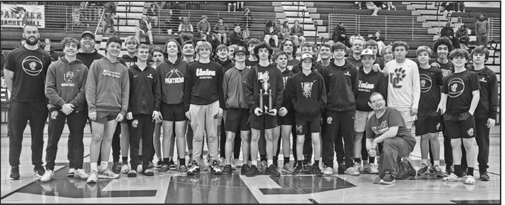
Union County's 8th grade boys basketball team is joined by the Panthers' varsity squad after the middle school was recognized during the high school's January contests vs. Athens Academy.